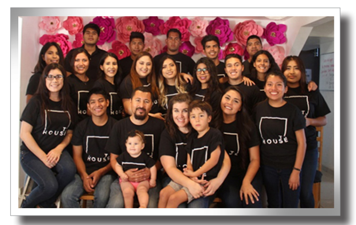
TJ House family

The TJ House is my favorite place. It is my place of peace and I feel safe when I am there. I will miss this home: the carne asada and volley ball on Saturdays, our obstacle courses in the yard, playing games and singing karaoke. I will miss going to church together and coming downstairs for pizza. I will miss each of the people I live with and this house which is full of joy and fun.